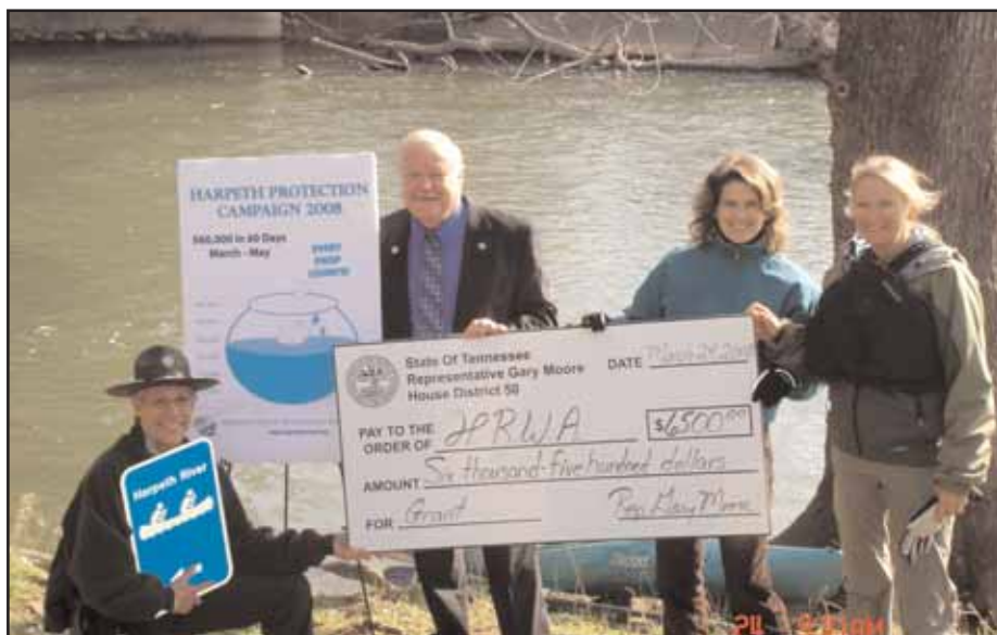
The Harpeth River Watershed Association accepted a $6500 community enhancement grant from the State of Tennessee to construct a canoe access ramp for the Harpeth River State Park that manages the public access at Highway 100 where it crosses the Harpeth River. The check was presented by Rep. Gary Moore on Monday, March 24.

As always, you can reach me at 862-6780, 352-7808 after 7pm or 300-7808 daily. My email address is eric.crafton@nashville.gov .